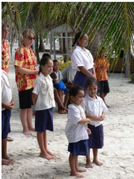
Children on Palmerston await our arrival in rubber Zodiac landing craft.