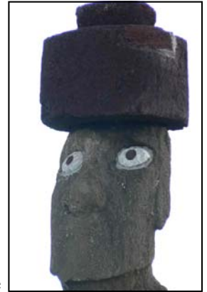
Detail of a 47 ft high 56 ton Easter Island Moai with coral eyes and a 3-ton top knot of volcanic tuff

the remains of very isolated human civilizations. Isolated Polynesians on Easter Island who constructed huge statues (called Moai) and Bounty mutineers on remote Pitcairn Is., who, against all odds, have a modern society with internet access (through Albuquerque NM—courtesy of a seismic station linked to the university in New Mexico) and a lively ham-radio group, with whom Paul visited.